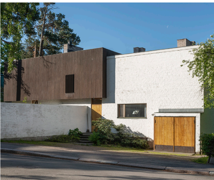
Aalto House