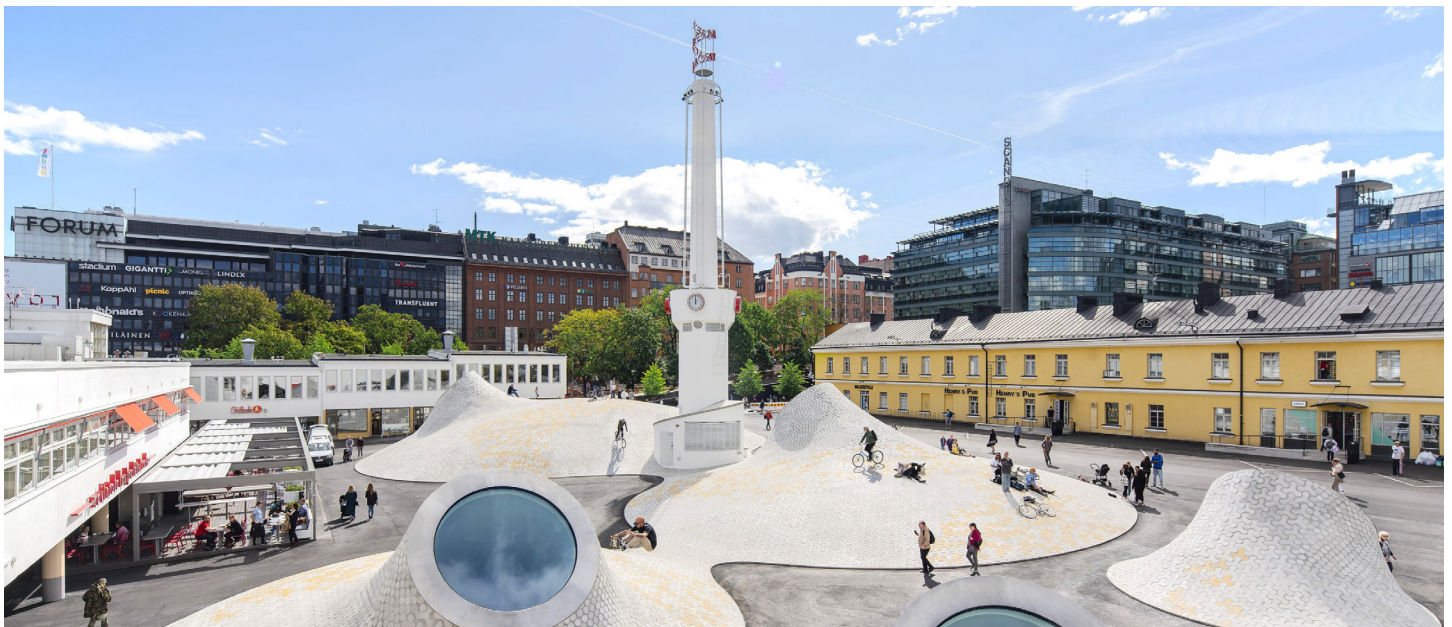
Amos Rex - JKMM Architects