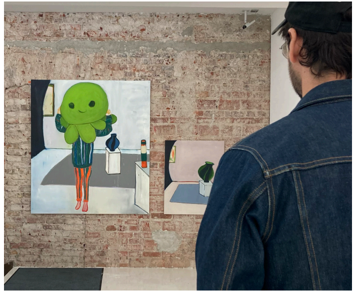
Patron Trip 2022

The FCINY offers an annual Ahti Circle Patron level for supporters of the Institute, priced at $700. As a member of the Ahti Circle, you're supporting key programming at the FCINY, making it possible for the Institute to launch timely programming and fuel support for emerging Finnish artists, architects, designers, and curators. Ahti Circle members are invited to join the FCINY's curated explorations of Finnish art, architecture, and design in NYC, for a select portion of the event series annually.