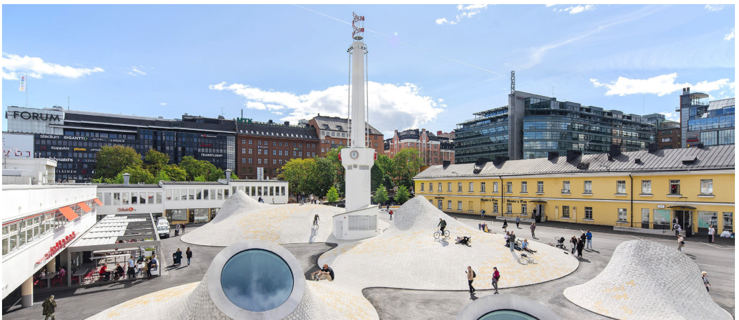
Amos Rex - JKMM Architects