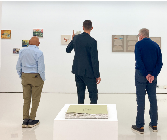
Patron Trip 2022

Spring 2023: Beginning of 2023 Patron Season