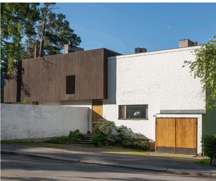
Aalto House