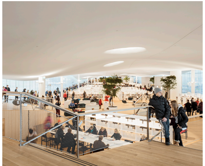
Oodi - ALA Architects